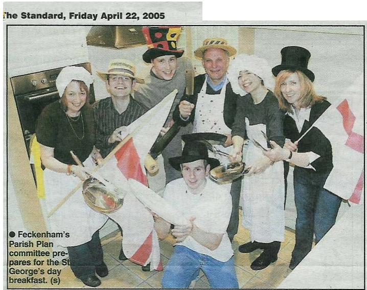
The Standard, Friday April 22, 2005